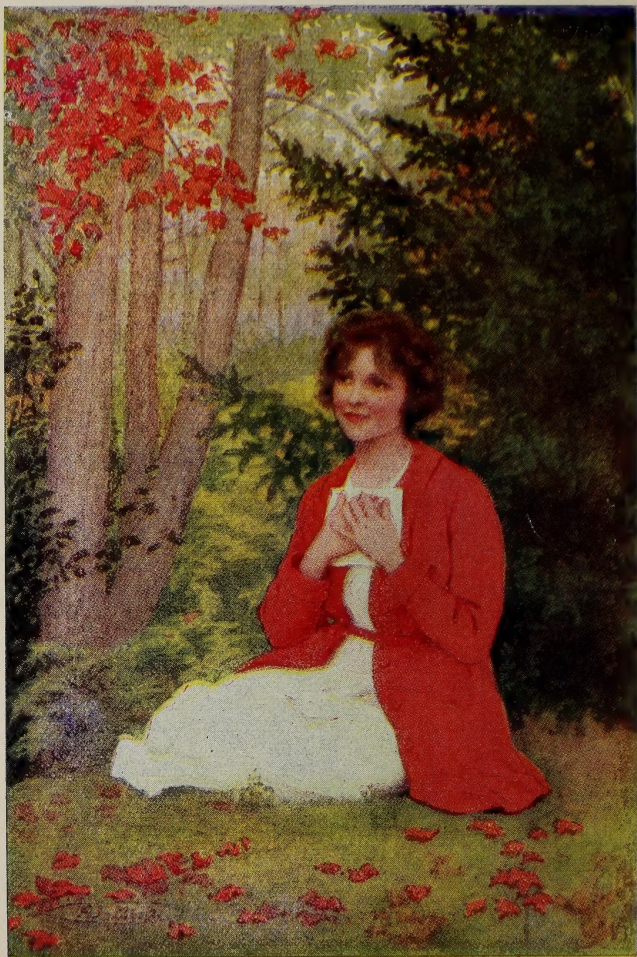
"RILLA READ HER FIRST LOVE LETTER IN HER RAINBOW VALLEY FIR-SHADOWED NOOK"